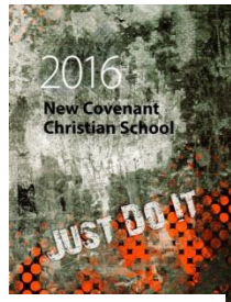
(last year's cover)